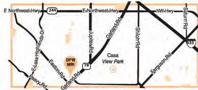
2-1/2 MILES SOUTH OF I-635 NW Corner of Garland Road and Easton Road