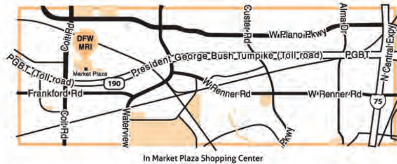
In Market Plaza Shopping Center